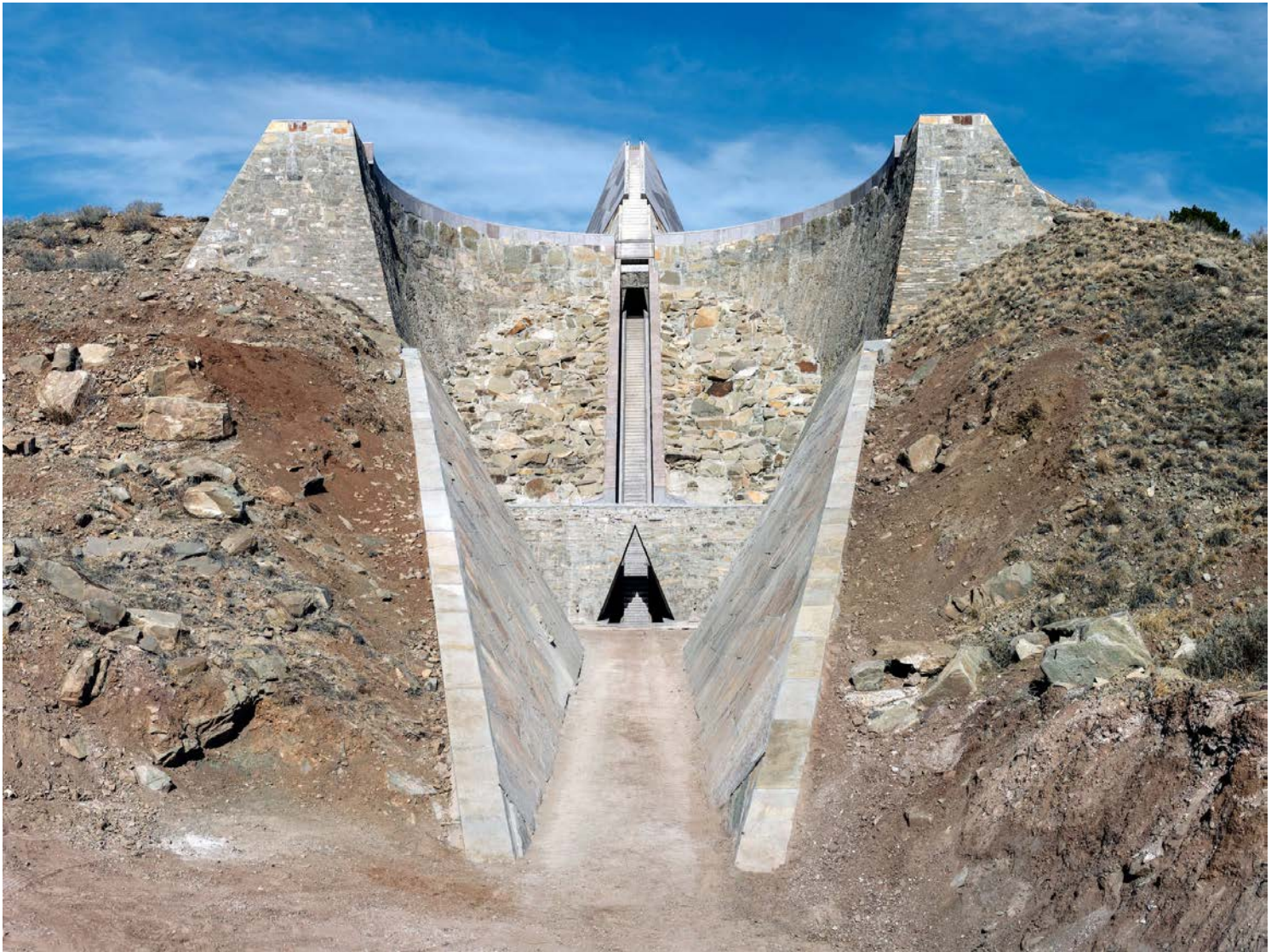
The entrance to “Star Axis,” with 30-foot-high stone walls built using ancient techniques. Andres Gonzalez