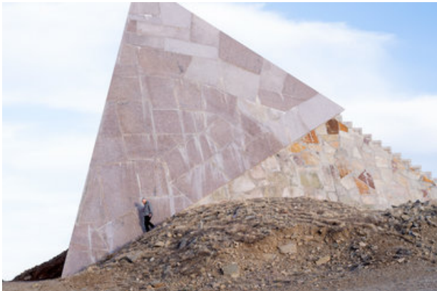
A Land Art Pioneer’s Adventures in Time and Space