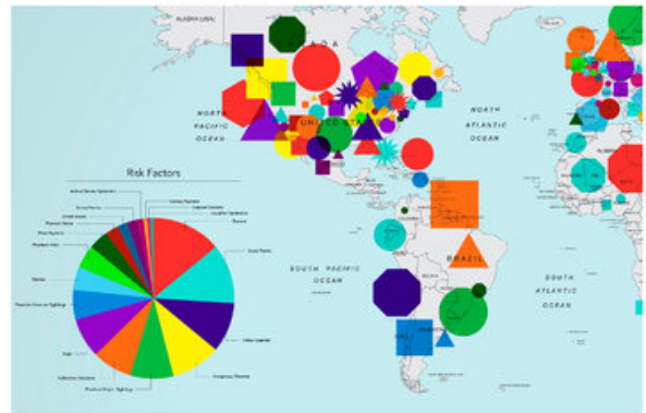
12 Artists On: The Financial Crisis