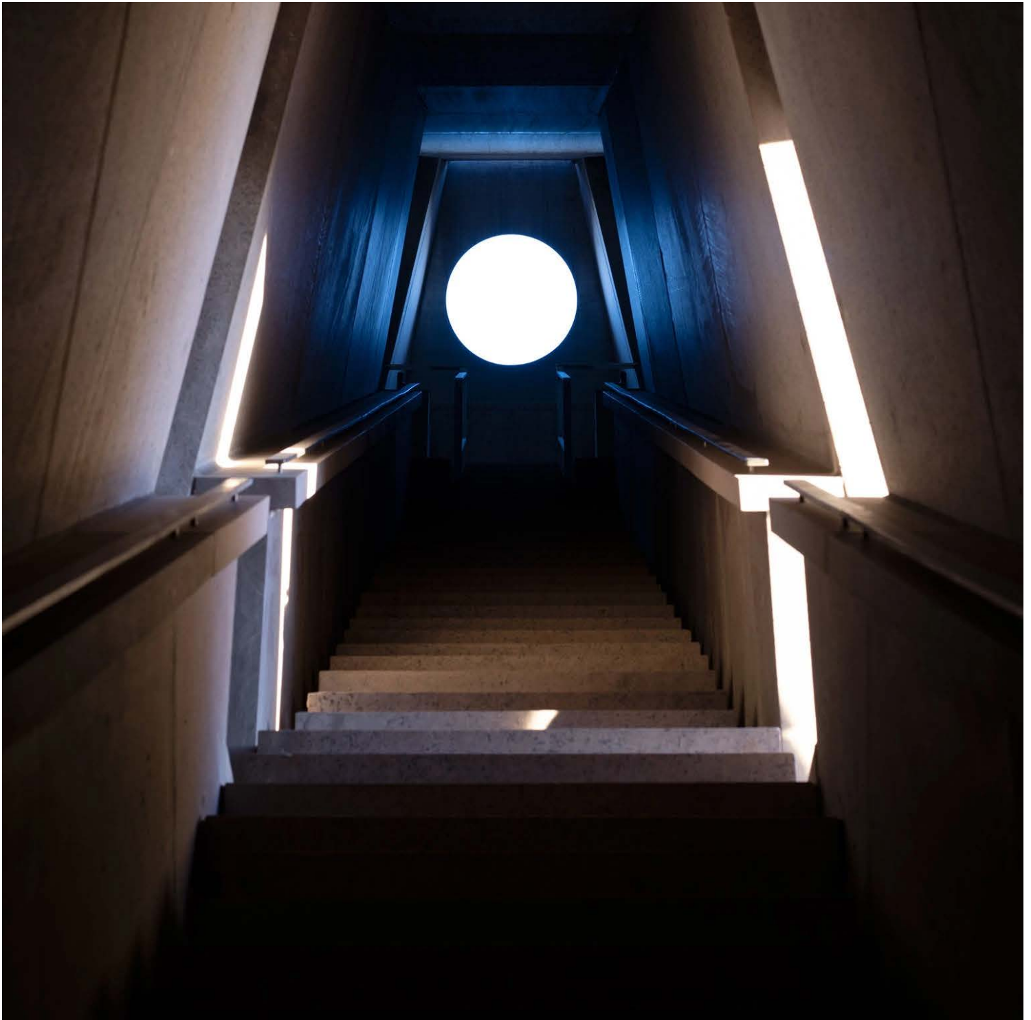
The “Star Axis” oculus, at the top of a set of 147 stairs, is 40 inches wide, but from the bottom it seems only the size of a dime held at arm’s length. Andres Gonzalez

At the first tread, the stars come suddenly into view, framed by an oculus that seems the size of a dime held at arm’s length. You can make out Polaris, at the rim, flashing brighter than the others as it traces its daily small circle with the earth’s rotation. As you ascend, the aperture grows, the haze of cosmic matter coming into focus as though you are turning the knob of a microscope. Earlier, Ross explained how his illustration of precession works: At the bottom of the stairs, you see through the porthole the sky more or less as it is today (actually, as it will be in around 2100, when, as it happens, Polaris and the pole itself will be perfectly aligned). But with each step (he commissioned professors from the University of