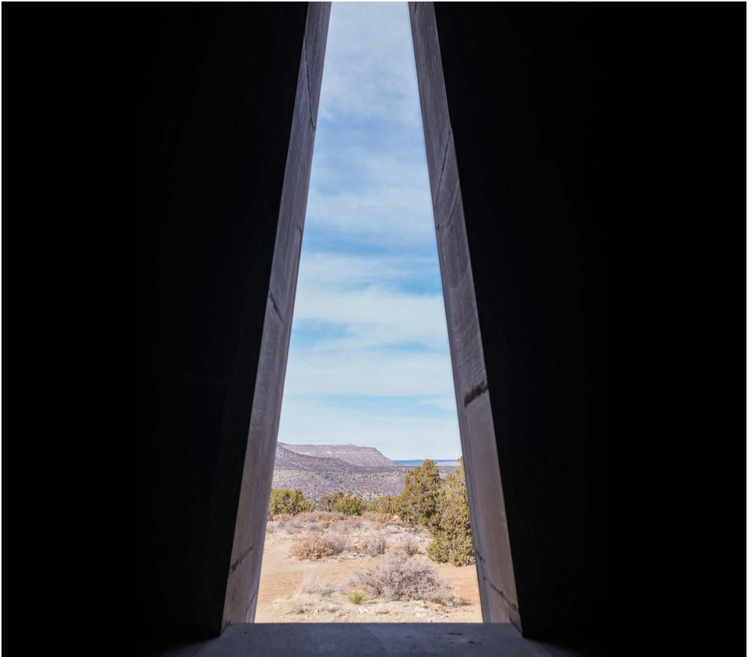
The view from the Hour Chamber at “Star Axis,” where visitors will be able to observe one hour of the earth’s rotation. The North Star, Polaris, is framed in the apex of the 15-degree triangular opening; it takes exactly 60 minutes for a star anywhere along the left (west) edge to travel to the right (east) edge. Andres Gonzalez