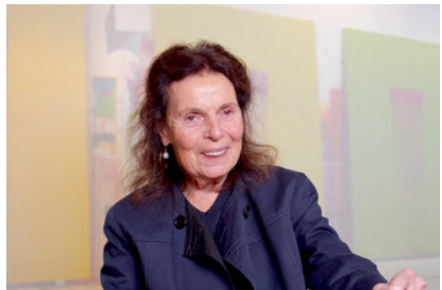
My Favorite Artwork | Pat Steir